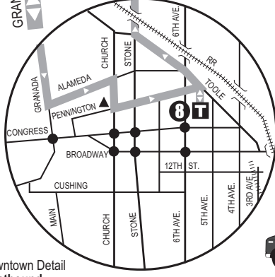
Downtown Detail Westbound (Detalle del Centro Hacia el Oeste)