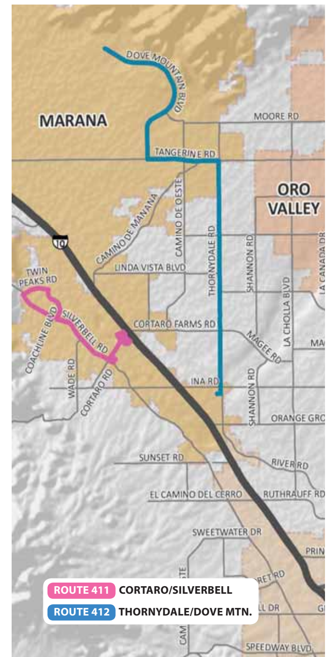
ROUTE 411 CORTARO/SILVERBELL ROUTE 412 THORNYDALE/DOVE MTN.