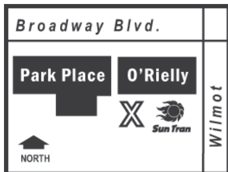
Park Place - East side behind O’Rielly Chevrolet