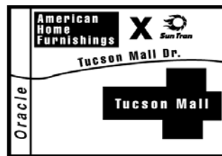
Tucson Mall-Northwest corner East of American Home Furnishing